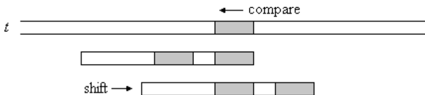
Figure 1: The matching suffix (gray) occurs somewhere else in the pattern

Case 2: Only a part of the matching suffix occurs at the beginning of the pattern (Figure 2).